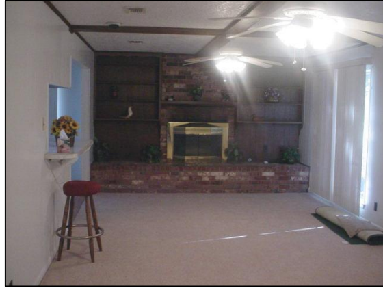
Unit 1 Wood Burning Fireplace