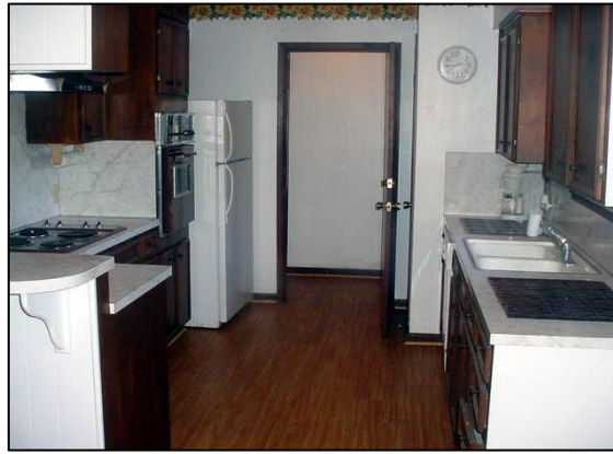
Unit 1 Kitchen