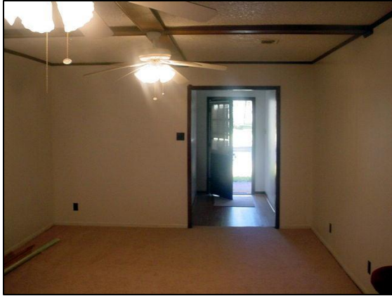
Unit 1 LR and front entry