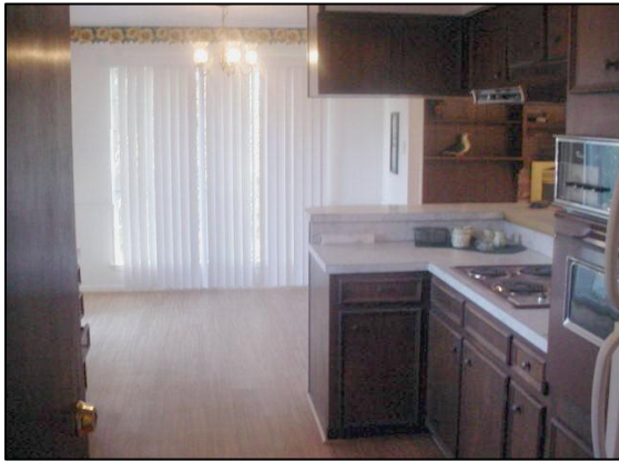
Unit 1 Kitchen View into Dining area