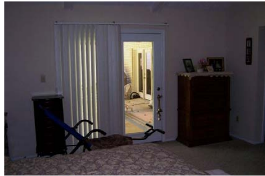
Master bdrm. has direct access out onto covered patio