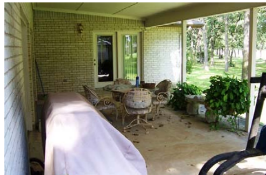
covered patio overlooking golf course and #6 tee