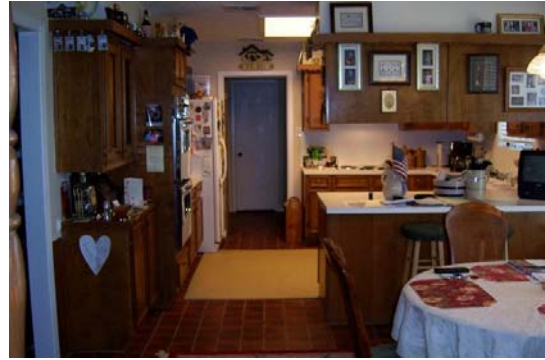
9'3" x 12'8" Kitchen