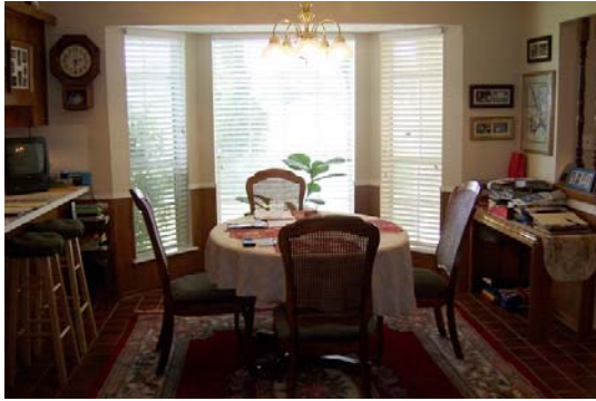
13' x 12'8" Dining Room