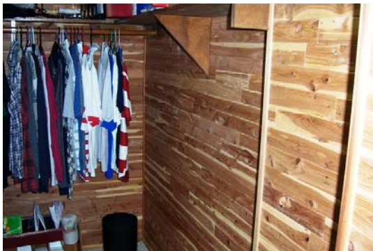
1 of 2 cedar closets in master bedroom