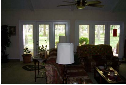
26' x 19'6" Family Rm. with french doors to patio, vaulted ceiling fireplace, built-in shelving