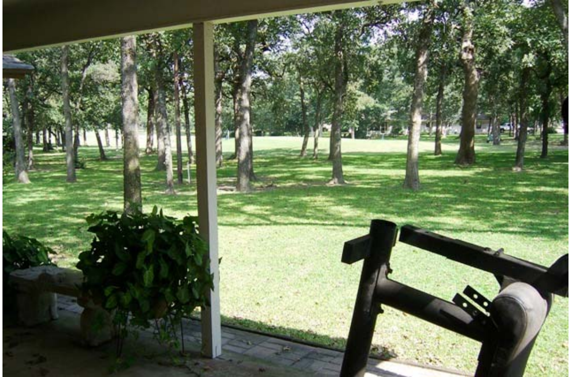
The view from the covered patio