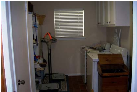
7'6" x 12'8" utility room