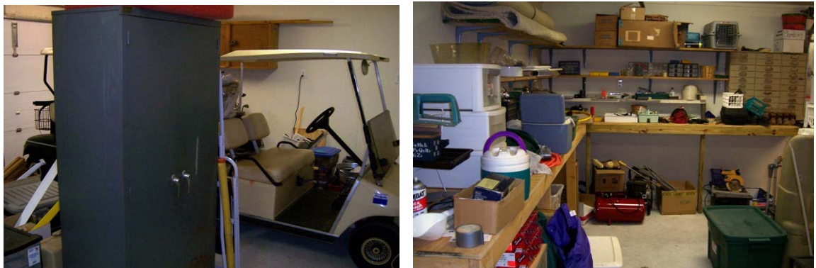
The golf car garage has plenty of storage and work shop.