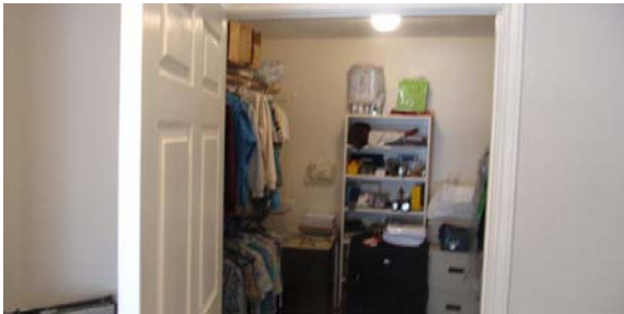
Large walk-in closet in master bedroom