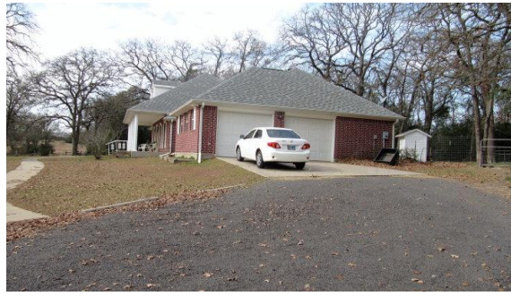
Driveway from FM 39 to garage entry is slag