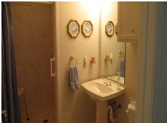
The 2 nd bath (shown) has extra wide door for wheelchair access and shower with chair.