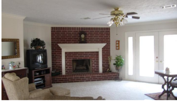
Wood burning fireplace in family room