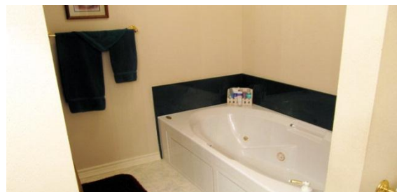
and bath with shower stall and jet tub

Current total taxes paid were $1,224.57 with the following exemptions: homestead over 65 and agriculture exemption (livestock lease on pasture).