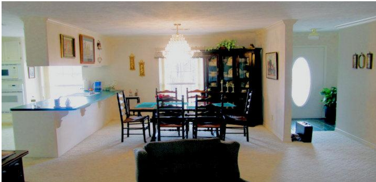
Open concept showing (left to right) kitchen, dining area and entry