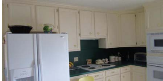
Refrigerator (stays) and cooktop