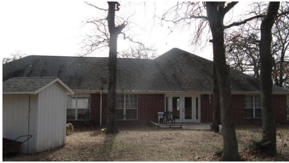
Back side of house and deck, well house