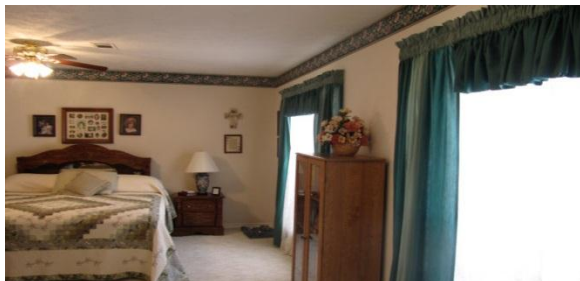
Master bedroom has sitting area