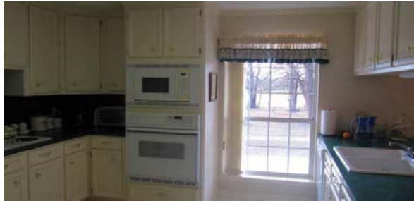
Built-in double oven and microwave