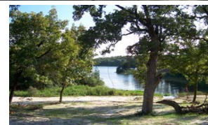
View from Lot 19