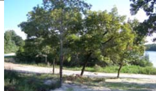
North side of Subject (heavy woods)