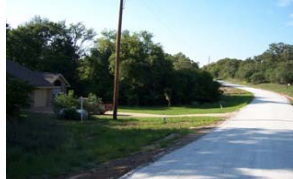
Home on Lot 16; subject beyond