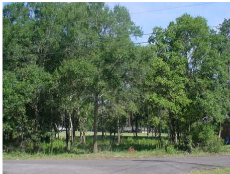
View from Fairway Drive - Paved