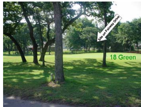
View showing back & 18 Green