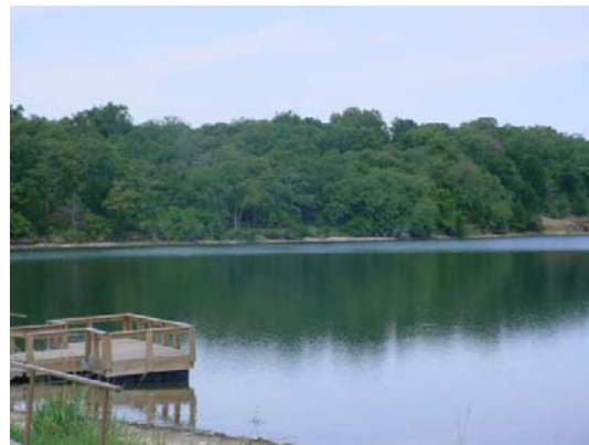
Lake side view from park

The information contained herein is from the owner and other sources deemed reliable but is subject to verification by the purchaser and agent assumes no liability for correctness thereof. The property is subject to prior sale or removal from market without notice and is offered without respect to race, color, natural origin, religion or familial status.