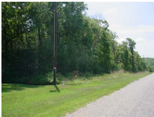
Road frontage view along Trailride